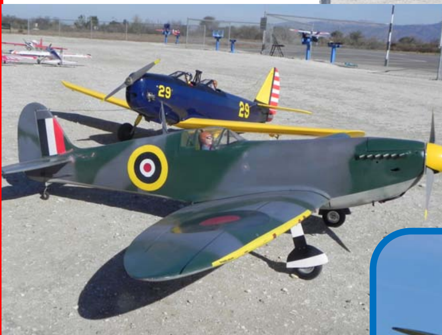
Left - Howard Power's Spitfire and Ryan. Good looking airplanes, Howard. As you may have noticed, Howard specializes in war birds.