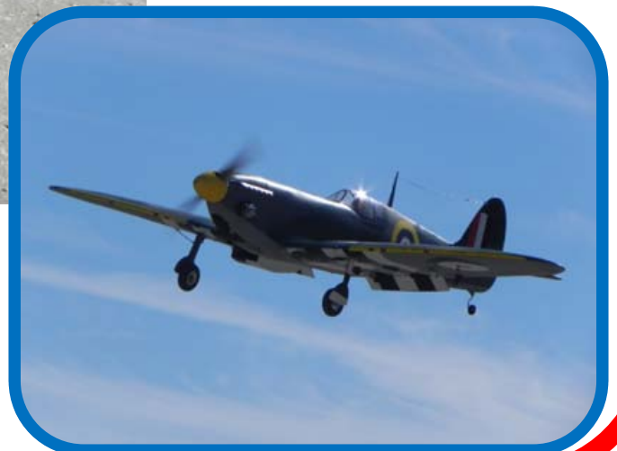
Right - The Spitfire in the air