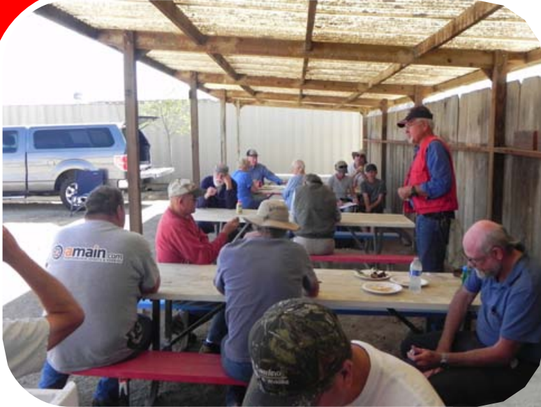
Left - Feeding the troops after work day. Thanks to all who were present to help maintain our facility.