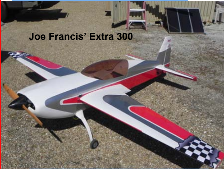
Joe Francis' Extra 300