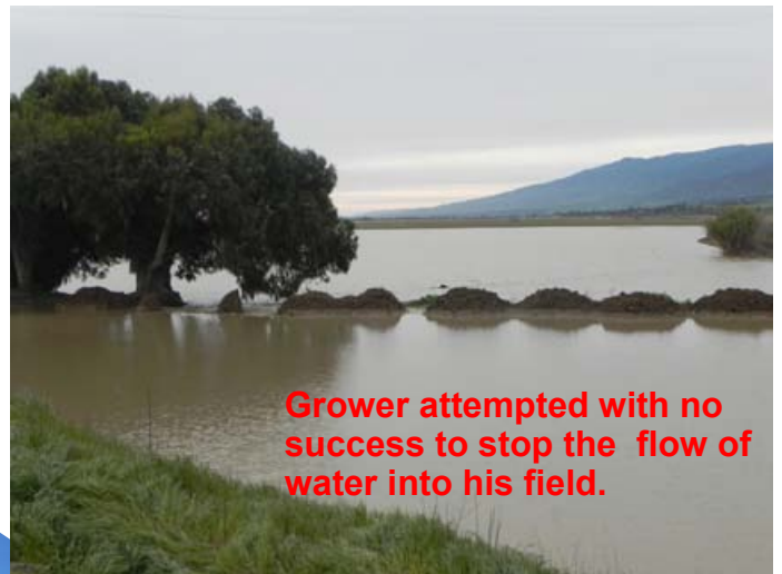
Grower attempted with no success to stop the flow of water into his field.