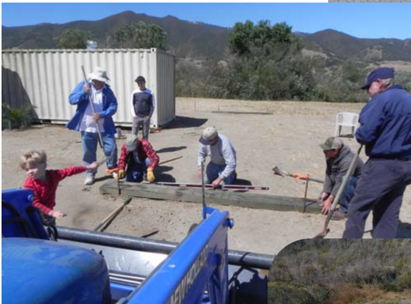
The group to the left were setting timbers on which to place the additional storage container the Club purchased. However the Monterey County Building Department decided we did not have sufficient

setback from the property line in that location so we had to relocate the site east of the 40' storage unit already in place. The new one will be used strictly to garage the trailer obtained from Dale Oxford and the retrieval boat that goes with it, and the tractor along with it's related support equipment.