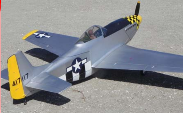
Howard's Mustang is back!