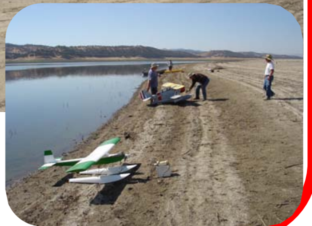
San Antonio Lake float fly - October 13-15, 2017