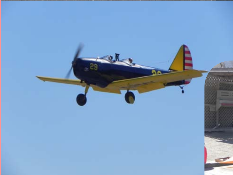
Above - Howard's PT-19 (repaired). Just don't let it any where near a Cub!!!