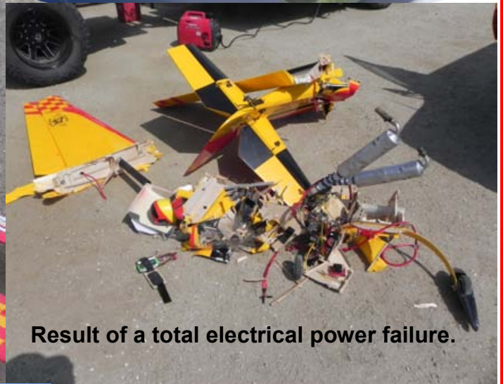
Result of a total electrical power failure.