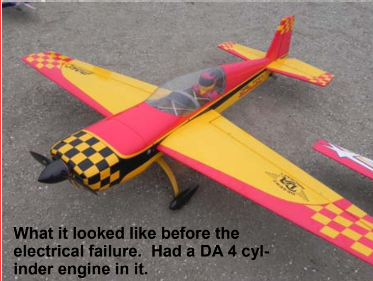
What it looked like before the electrical failure. Had a DA 4 cylinder engine in it.