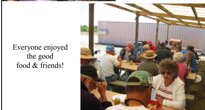
Everyone enjoyed the good food & friends!