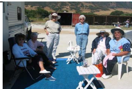
And here you have a small sampling of the "SAMettes"