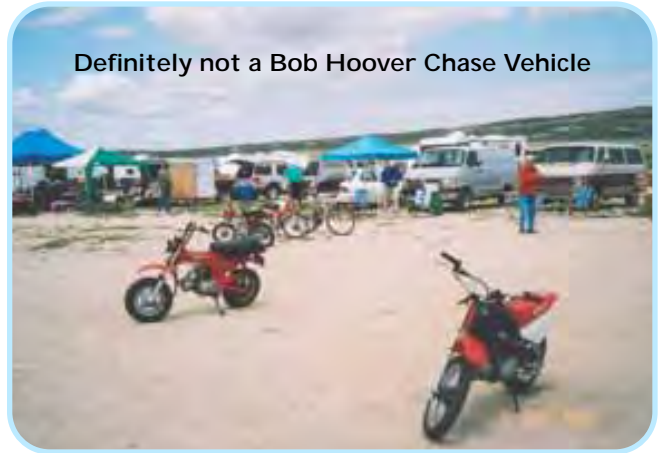
Definitely not a Bob Hoover Chase Vehicle