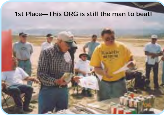
1st Place—This ORG is still the man to beat!