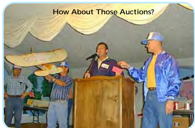
How About Those Auctions?