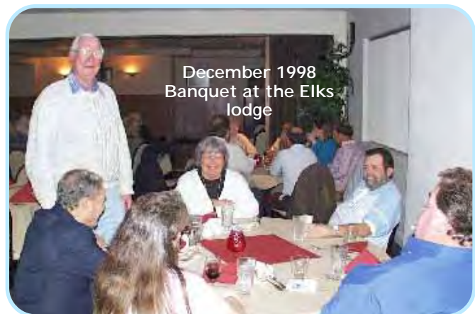
December 1998 Banquet at the Elks lodge