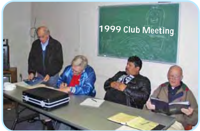
1999 Club Meeting