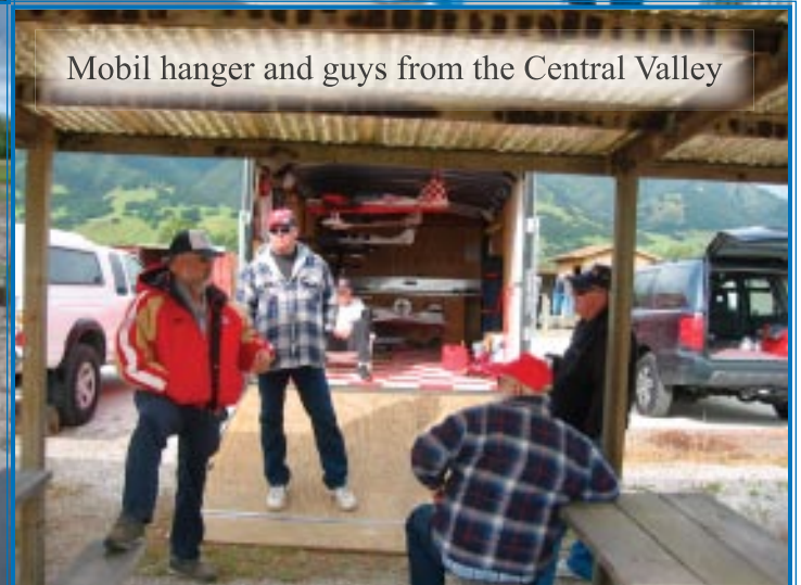
Mobil hanger and guys from the Central Valley