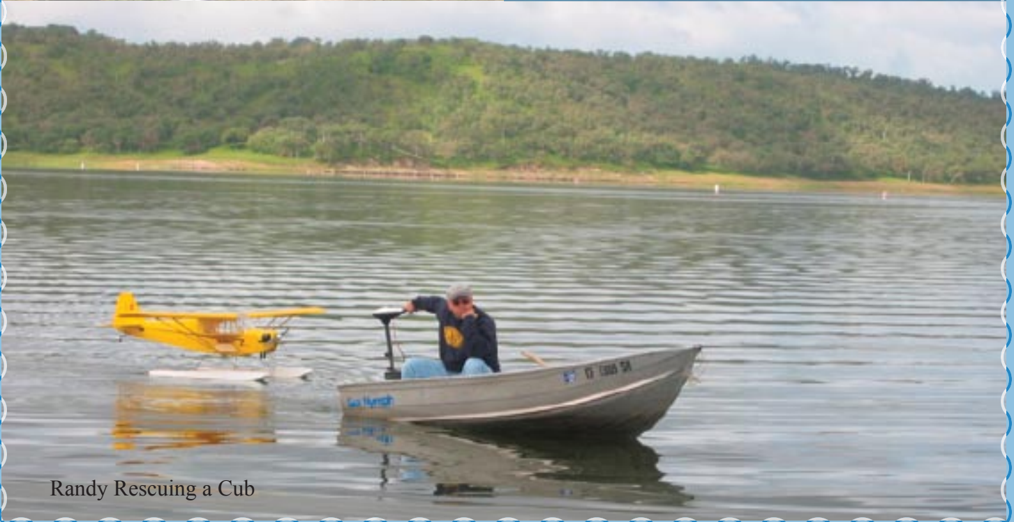
Randy Rescuing a Cub