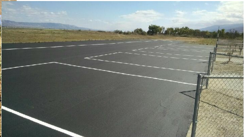
Left: Looks a little better with the bamboo cut and hopefully will stop the justified complaints of the overhanging stuff hitting vehicles. Above is a shot of the newly sealed runway.