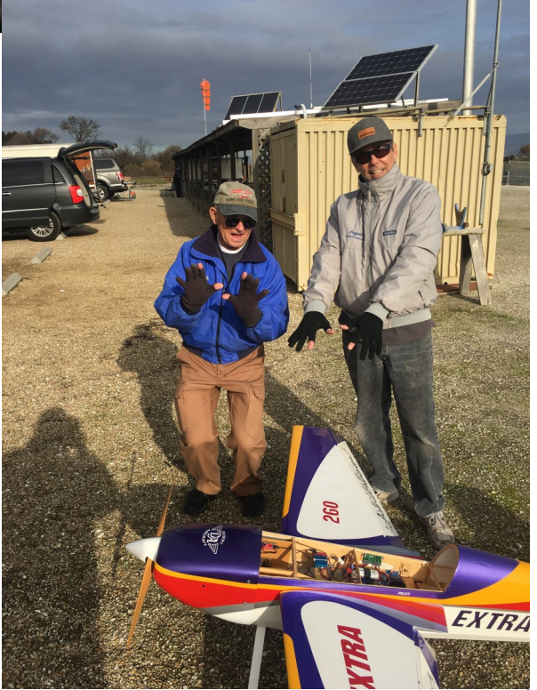
Yes, it was cold that morning but cloth gloves with the index finger and thumb clipped off make great flying gloves