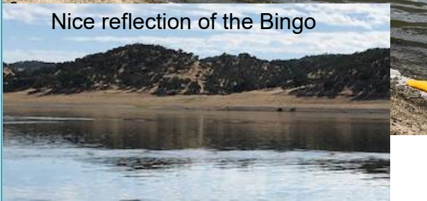
Nice reflection of the Bingo