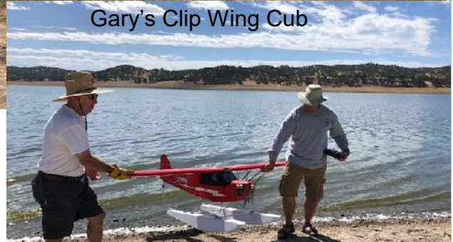
Gary's Clip Wing Cub