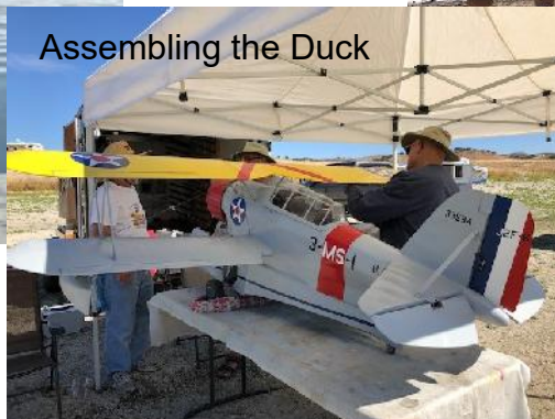
Assembling the Duck