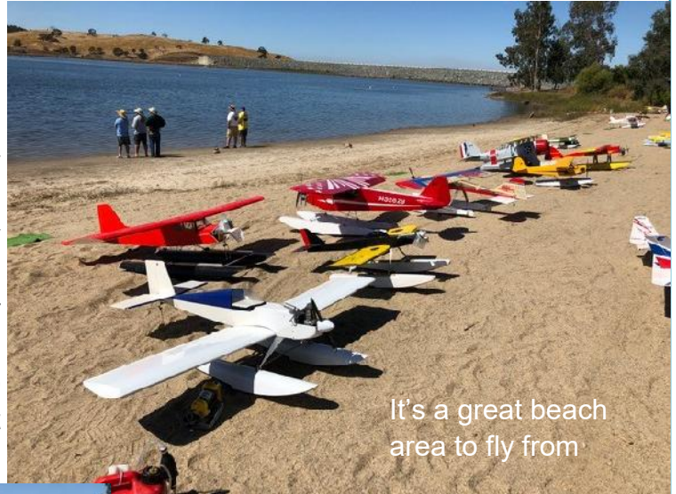
It's a great beach area to fly from