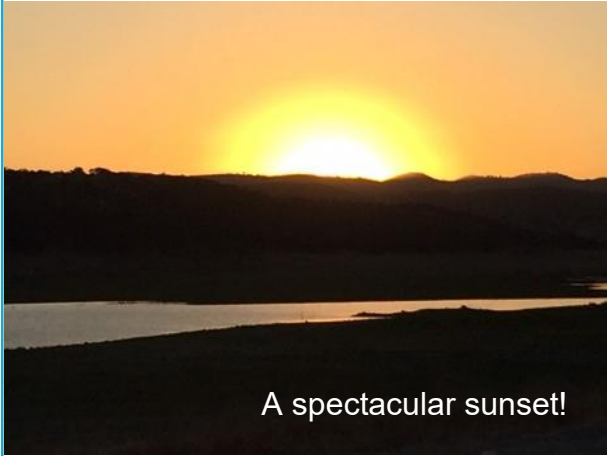
A spectacular sunset!